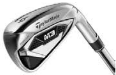
TaylorMade M3 Irons (estimated value $800)