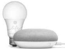
Google Home with Smart Lights (estimated value $55)

Any contractor that donates to NECAPAC from September 1 through the last day of Convention will automatically be entered in the Sweepstakes.