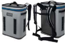
Yeti Soft Backpack Cooler (estimated value $300)